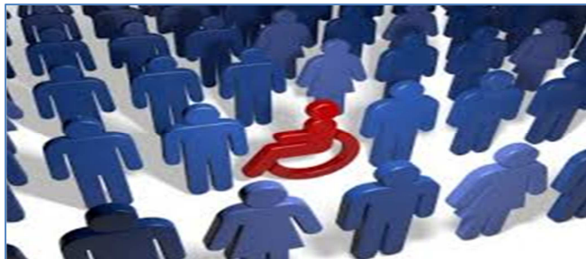
Illustration: Employment of Persons with Disabilities is a Big Problem

I: INTRODUCTION: Constitution of Montenegro guarantees the right to work to every citizen. 1 Further study shows that the government of Montenegro, during the period from 2009 to 2015, caused damage to persons with disabilities on basis of employment in the amount of €34.5 million, which should be paid for professional rehabilitation and employment of these persons.