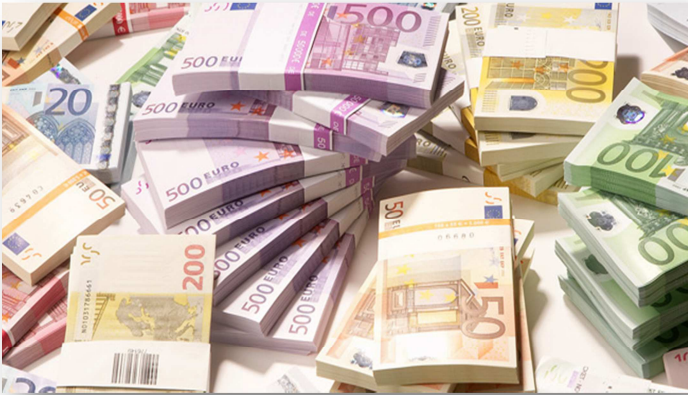
Illustration: Increase of disputable budget items for €9,3 million

I: Introduction: In the Draft Law on the Budget for 2016, the Government of Montenegro has increased expenditures of individual ministries and state funds for €9.3 million compared to the previous year on several budget items, for which MANS Investigation Center previously found to be significantly used for electoral abuse. Such expenditures are planned for severance payments, subsidies, transfers to institutions, municipalities and individuals, budgetary reserves and one-off welfare payments.