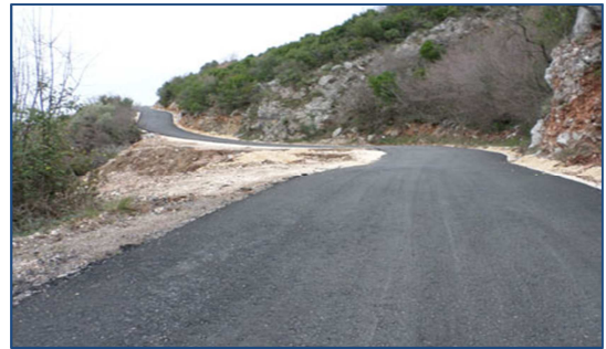
Image: Asphalt road

Before the October parliamentary elections, the Ministry of Sustainable Development significantly increased the expenditures for the local infrastructure through the capital budget, as shown in the study below.