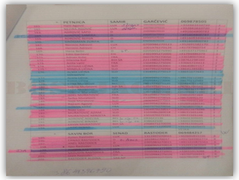
Part of lists published on the portal Bosnjaci.net

I: Introduction: Right before the parliamentary elections were held in Montenegro on 16 October 2016, the portal "Bosnjaci.net" published the lists of voters Bosniak population living abroad, who were contacted by activists of the Democratic Party of Socialists to come to vote for the party. In return, their travel expenses would be covered.