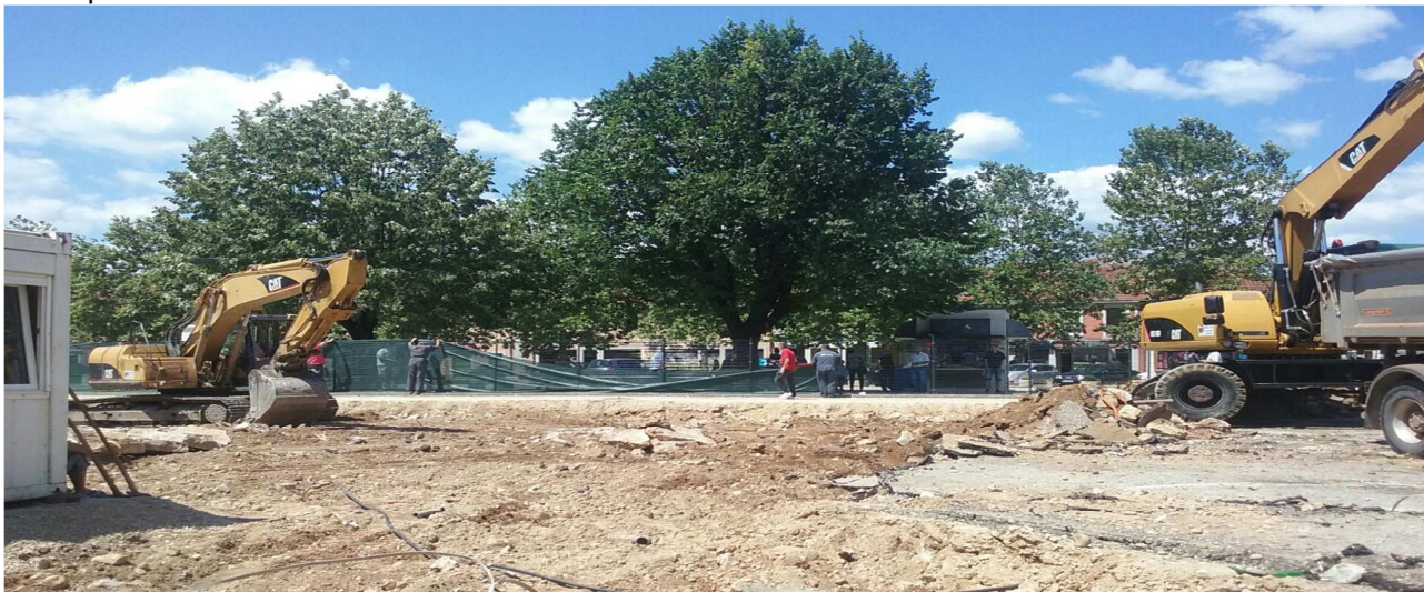
The biggest investment in the election period in Niksic was the reconstruction of Trg Slobode

Municipality of Niksic follows a similar trend by having spent €780,000 in the three election months, or an average of €260,000 a month. At the same time, the official figures show that in the first half of 2016 the Municipality set aside about €238,000 or €37,000 a month for the local infrastructure, which means that the expenditure increased sevenfold.