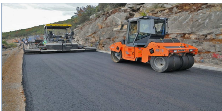
Image: Asphalt Resurfacing

I: INTRODUCTION: The Transport Directorate, which is under the Ministry of Transport and Maritime Affairs, is in charge of the implementation of the capital budget for construction and reconstruction of regional roads and highways. In addition, the Directorate provides the funds for the investment asphalt resurfacing, which is a project that is being implemented in the so-called five territorially marked sections, i.e. Podgorica, Niksic, Pljevlja, Berane and Kotor. 1