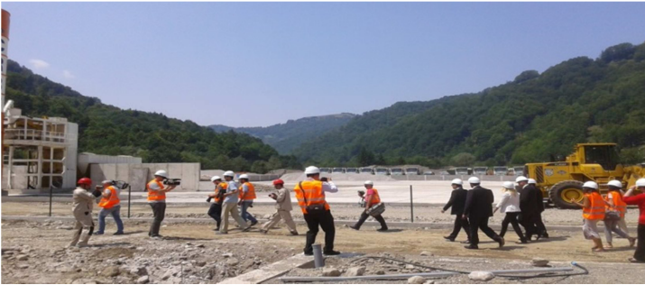
Highway construction site is currently the largest one in the country

I: INTRODUCTION: Expenses for expropriation of land, which the state pays for property taken due to the construction of infrastructure projects, significantly increased in September 2016, when €800,000 was paid for this purpose. This coincided with the period preceding the parliamentary election in Montenegro. 1