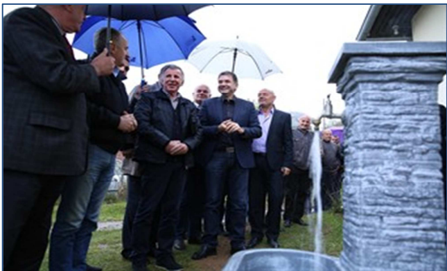
Former Minister Petar Ivanovic opens water supply system in Rozaje at the end of election campaign

In addition, Podgorica-based Vodovod i kanalizacija d.o.o. (Water Supply and Sewage Company) received around €55,000, but certain primary schools also received grants totaling several thousand euros.