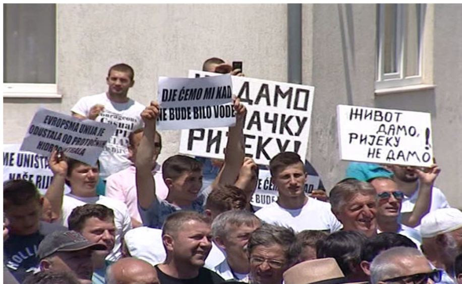
From one of the citizens' protests, June 2017

V:CITIZEN PROTESTS AGAINST CONSTRUCTION OF SHP: In mid-2017, citizens in the north of Montenegro, in the areas where the construction of SHP is planned or already started, began protests against the construction of new mini power plants and demanded that a moratorium be declared on their further construction. 53