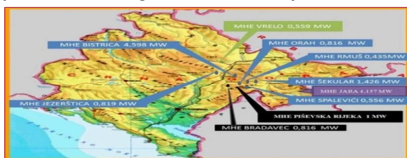
SHP map in mid-2017

were six more in the plant, two started to produce electricity in 2016, and another one by mid-2017.